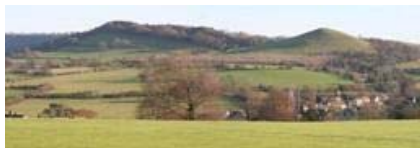
Left: Capturing the beauty of our area. Dave Line's inspirational photograph.